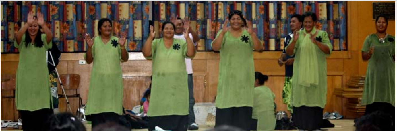
The touring "Titanika" women's cultural group from Atafu performed with flair and vibrancy to an entertaining packed house at the Matauala Hall, Cannons Creek, Porirua. The Titanika group is on its way to Townsville, Australia after showcasing their talents in Auckland, Hutt Valley and Porirua.