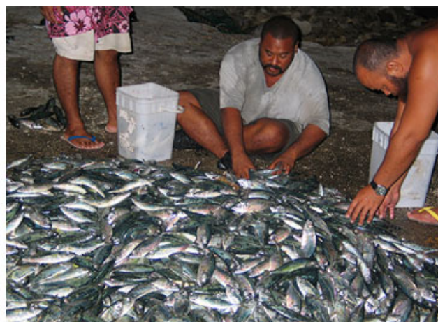
The inati system ensures every family shares in the fishermen's catch.