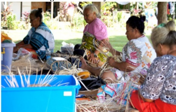
Women committee members, that is the fatupaepae, at work with handicrafts.

There is very limited unemployment in Tokelau. The 200 government jobs are funded by the national budget. This is currently the major source of monetary income for the Tokelauan people. Almost all the jobs are held by Tokelauans and only a few positions are assumed by expatriates. About half of these jobs are temporary and casual in nature as they are rotated among the community.