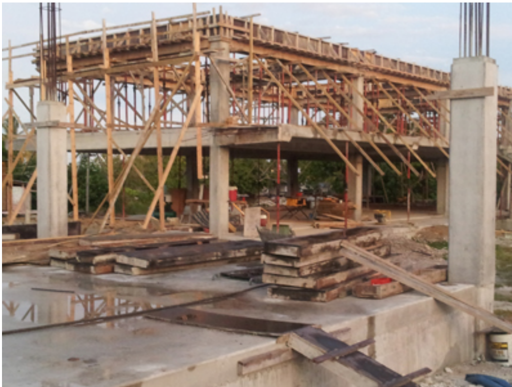
New Atafu school building under construction.

Tokelau acknowledges in its Tokelau National Strategic Plan (TNSP) 2010-2015 the importance of the MDGs to their national development, however, they also acknowledge the relevance of some MDG targets to Tokelau's unique situation as a small island nation.