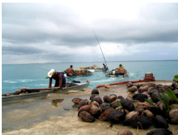
Fishermen coming in after fishing.

coins and handicrafts. While initiatives are in place to enhance its economic development efforts, these will never be sufficient to remove Tokelau's dependence on financial assistance from development partners such as New Zealand.