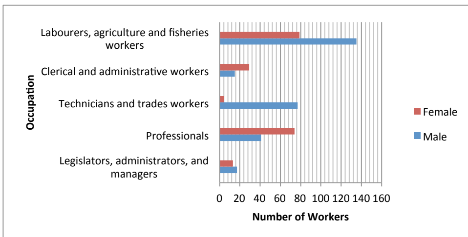
Figure 3.2 Occupation by Sex

agriculture, fisheries and technicians. According to the 2011 Tokelau Population Census the ratio of employed men to women (15 years and older) is approximately 3 to 2.