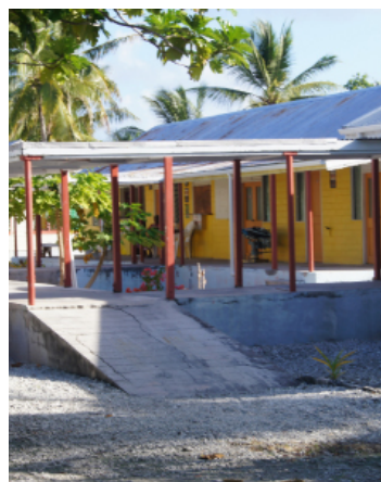
Hospital In Nukunonu

Tokelau receives funding for Child Immunisation from UNICEF and according to THD data, coverage is 100% for the last five years. Immunisation is an ongoing process until the last vaccine at age 11 years for females.