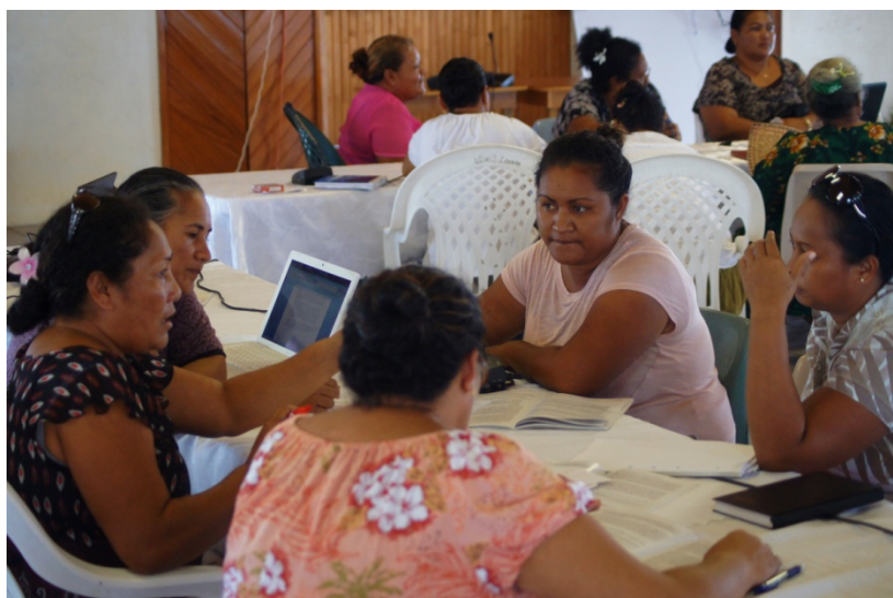
Fatupaepae members in consultations and training.